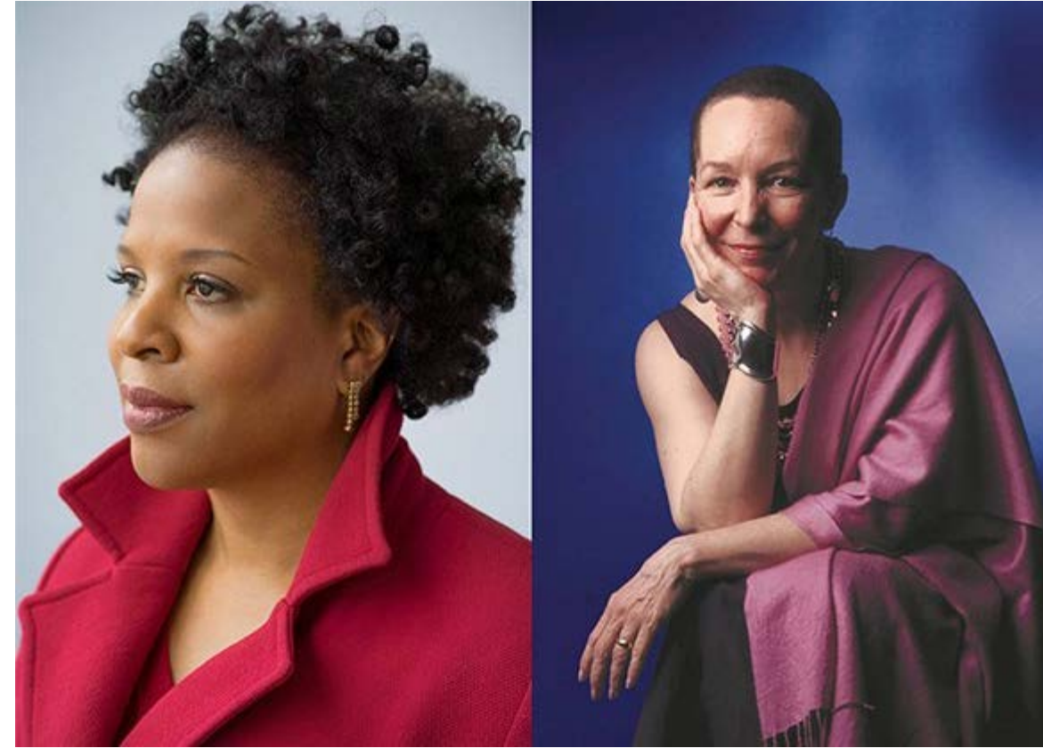
Tayari Jones (left,) and Pearl Cleage.

New York Times bestselling author Tayari Jones joins Pearl Cleage, the nationally recognized playwright and novelist, to discuss mentorship and writing on Thursday, Sept. 27, at 7 p.m. in the Jones Room. A reception and exhibit viewing precedes the event at 6 p.m. in the Rose Library. The events are open to the public at no charge, but registration is strongly suggested (at the link below).