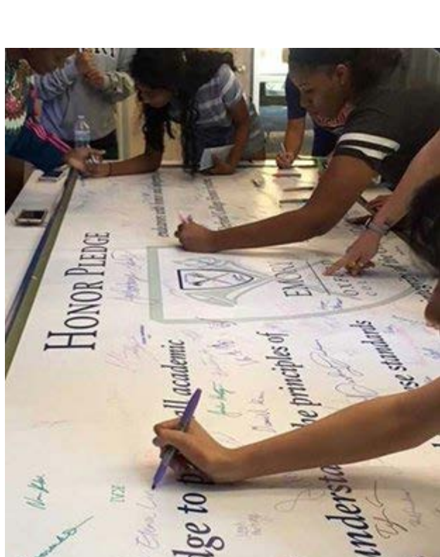
First-year students sign the Oxford Honor Code banner.

The Oxford College Library introduced first-year students to library resources just before the start of fall semester with a "LibCon" (named after DragonCon) parade through 10 learning stations.